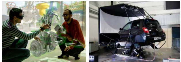
Figure 2: CAVE system (left) and dynamic driving simulator (right).