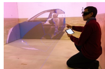
Figure 3: VARI3 allows a user to manipulate a virtual model using a tracked handheld tablet.

The Virtual & Augmented Reality Interactive and Intuitive Interface (VARI3) project is an ambitious collaborative endeavor, funded by French Government, with industry partners Renault, ON-X, Lumiscaphe, Theoris, and CEA List. Over the past two years, the partners have designed and implemented a system which incorporates a tracked handheld tablet allowing users to manipulate and travel around a virtual automobile prototype while already immersed in a traditional CAVE system, as shown in Figure 3.