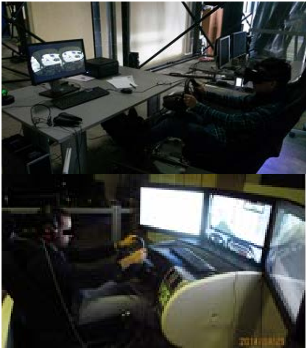
Figure 1 : a. Oculus rift HMD (upper view) b. ECO 2 in driving simulation (bottom view)

metrics, Figure 3) and the psychophysical situations (subjective measures through questionnaires, Figure 2) of the drivers' have been measured.