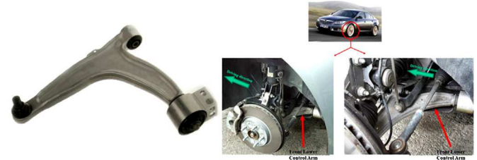
Fig. 2. The front lower control arm.

The production (or pre-consumer) scrap is treated to remove the fluids and dirt and is then reused in the manufacturing of the AA6082 ingot. The aluminium recycling process (post customer scrap) is described in [20].