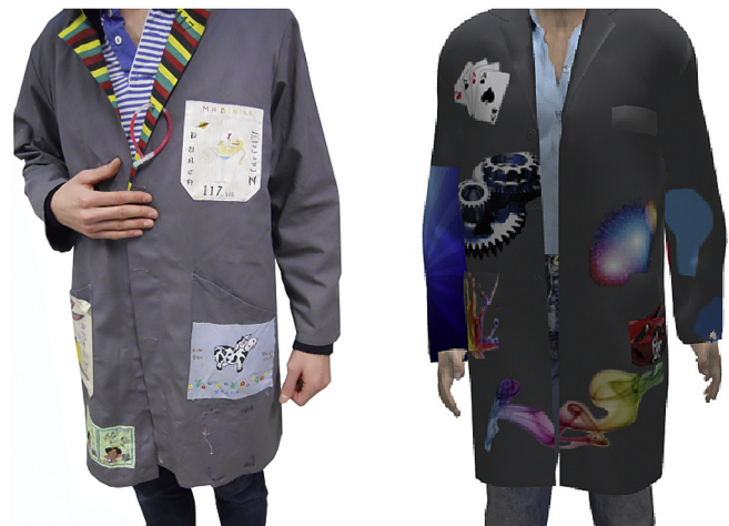
Fig. 1. Example of a real customized coat (left) and a virtual one for avatars (right).

All participants were students from ENSAM (École Nationale Supérieure d'Arts et Métiers), which is a French school of engineering known for the strong social identity of its students. This is a prestigious school, which has trained over 85,000 engineers since its foundation in 1780. Students and alumni of the school call themselves Gadzarts (in the remainder of the article, we use the term “ingroup” to refer to Gadzarts ), which means “ Gars des Arts ” (i.e., “Guys from the Arts”, “the Arts” being the school’s short name). Gadzarts are organized in an association and perpetuate their own traditions and folklore, which comprise special clothing, language, songs, legends, related symbolism, and ceremonials. All these items reveal a strong and positive social identity. Traditional clothing includes a gray biaude (see Fig. 1, left), which is a sort of blouse that