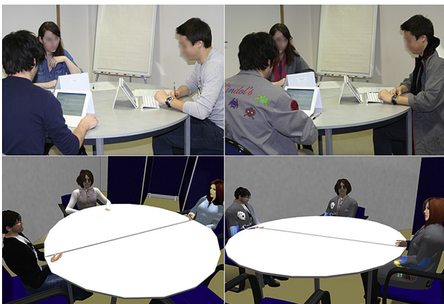
Fig. 2. Participants in the Control (top left), Face-to-face + SIC (top right), Virtual (bottom left) and Virtual + SIC (bottom right) condition.

In line with Hypotheses 1 and 2, we studied the performance of brainstorming groups in 2 (SIC: without vs. with) x 2 (Setting: face-to-face vs. virtual) brainstorming conditions (between-subject variables): in the face-to-face setting without SIC (Control condition, see Fig. 2 top left panel), in the face-to-face setting wearing their coat (Real + SIC condition, see Fig. 2 top right panel), in a virtual environment using avatars with neutral clothes (Virtual condition, see Fig. 2 bottom left panel) or in a virtual environment using avatars wearing coats (Virtual + SIC condition, see Fig. 2 bottom right panel). The groups were randomly assigned to the