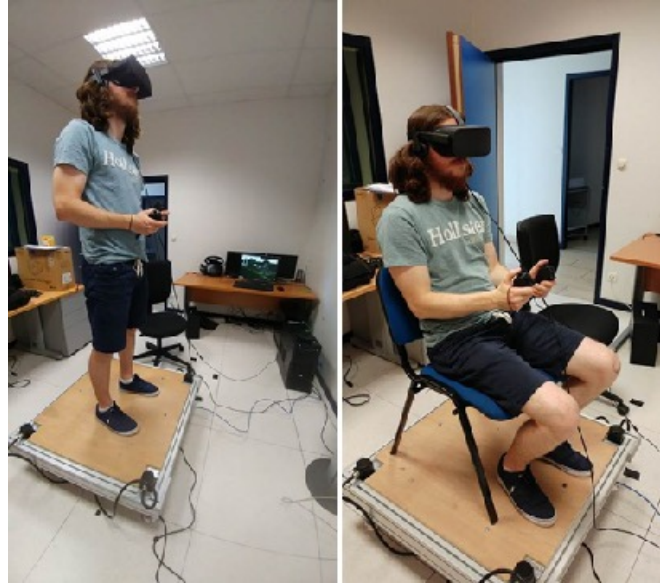
Figure 3. Walking simulation on left / Driving simulation on right.