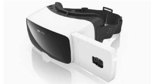
Figure 2: A VR ONE HMD (Head Mounted Display) Mobile headset

Devices. Each participant used the edutainment "King Tut VR2" application twice with two different devices: A VR ONE HMD Mobile headset with a Samsung Galaxy S6 mobile phone (See Fig. 2). The phone speakers played the application sound. The participants could interact in the application with their head, by moving a cross-hair in their field of vision on the desired area.