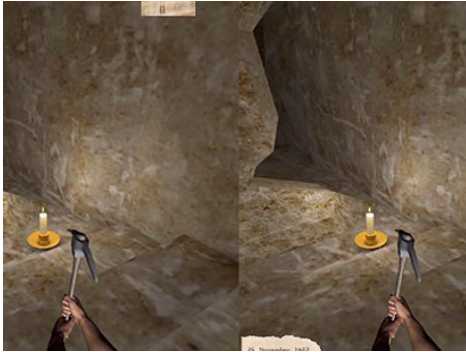
Figure 4: A screen shot of the “King Tut VR2” (Copyright ©, EON Reality, Inc) application in the HMD Mobile device

3.2.4 Task. The experiment consists of the use of the edutainment “King Tut VR2” application designed by the EON Reality SAS company. The goal of the “King Tut VR2” VE application (see Fig. 4) is to relive the journey of Howard Carter and his discovery of King Tutankhamun’s tomb. The participants were asked to follow the instructions given by the voice-over in the VR application. The tasks covered passive activity (i.e., watching and listening to Howard Carter’s journey) and active activity (i.e., excavating with a pickaxe in the ground).