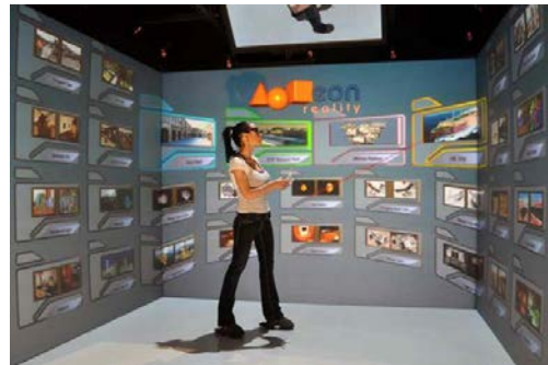
Figure 3: EON ICUBE CAVE (Cave Automatic Virtual Environment)

A EON ICUBE CAVE (see Fig. 3) composed of four walls (in the front, on the left, on the right and on the floor) delimiting a 10-by-10-foot room with projectors aimed at each wall and a ceiling projector aimed at the floor with trackers to track the stereoscopic 3D glasses and the gamepad. Loudspeakers played the application sound. The participants could interact with the gamepad by moving a virtual flystick in the desired area.