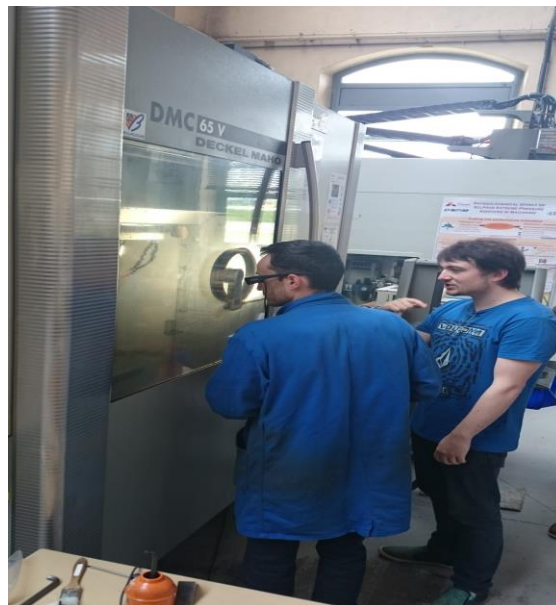
Fig. 5. A participant evaluating the application

We made a pre-user test with 5 participants, all of them use machine tools regularly (several times per week) but none of them are familiar with AR systems. We asked them through interviews to evaluate the usability of the system (“did you find the system easy to use?”), in terms of software and hardware manipulation (“did you find the user interface easy to handle?”), ergonomics (“how did you feel with the devices?”) and utility (“do you find the system useful?”, “would you use it every time?”). They were able to give also free comments. To answer the questions, a 10-point Likert scale was provided. We proposed two different devices: a tablet PC, needing however to hold it all the time, and EPSON Moverio BT-200 AR glasses, allowing participants to keep their hands free for other tasks. Both devices ran Android OS. No indication on how to use the system was provided to participants, to check its ease of use. The machining process to be executed was basic milling between two positions without any work piece. The process was performed on a DMC 85V machine tool. Participants had to launch the AR application, select the right machine tool, ask for specific parameters to be displayed, such as the tool position and cutting speeds, and supervise the machining process over the AR system without looking at the machine-embedded control screen (figure 5). Interviews were done at the end of the machining process.