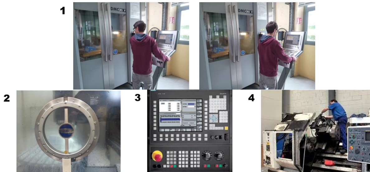
Fig. 1. Issues related to current use of CNC machine tools

In this regard, we present in this paper a work in progress of using this technology in the context of manufacturing with computer numerical control (CNC) machine tools. Issues are related to: (1) low ergonomics since the operator has to move continuously between the machine window and a control screen to ensure smooth operations; (2) the window is often obstructed by the lubricant, therefore the operator must often rely only on information displayed by the control screen; (3) a non-user-friendly interface of the machine, especially for beginners; and (4) a complex maintenance operation (figure 1).