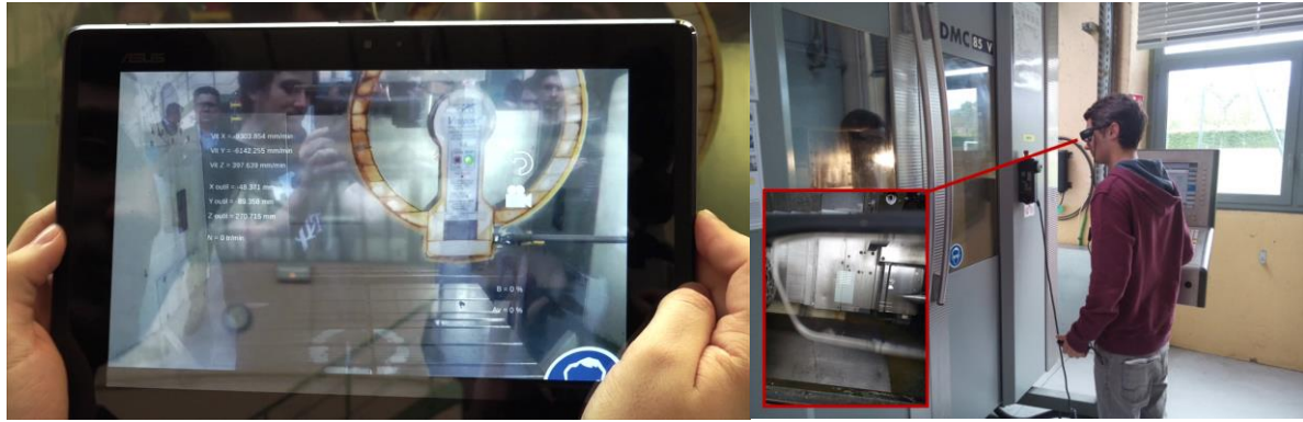
Fig. 4. AR system in operation (on the left: using a tablet PC; on the right: using AR glasses with a zoom on displayed information)