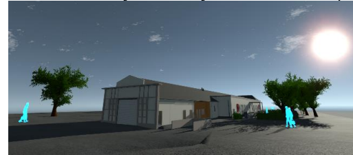
Figure 2: Nursery in VR.

the visibility of the objects. In this study case, we apply a binary choice: when walking outdoor, indoor objects are hidden, to consume less resources and when walking indoor, everything is loaded: in one future work we could show only the rooms close to the current one. About lights, as the building project is on built phase, major modifications are not possible. But at least users want to check the exposure depending on the sun, the interior lights and the walls/windows materials. For this issue we had to get back the building orientation from Revit to Unity. Then we use the Revit solar cycle simulation to get the positions of the sun path, depending on the date of the year. In Unity, we simulate three different solar cycles (equinox, summer and winter solstice). So we allow end users to check the building exposure in the VR system and to ensure quality to the user experience, users can stop at any moment the solar cycle and stay with the current exposure.