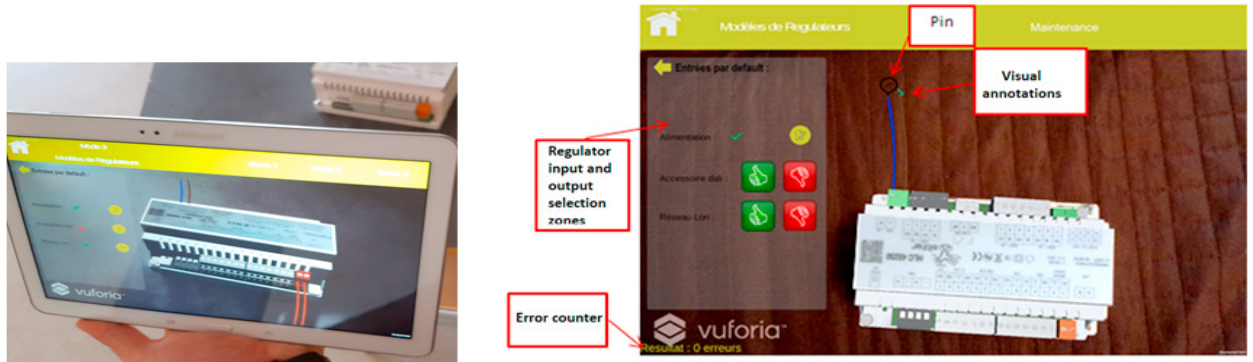
Fig. 2. (a) A screen-shot of the configuration guide module in augmented reality of the terminal controller; (b) A screenshot of the augmented reality maintenance guidance module.

verify the connection (see Figure 2-b). As this figure illustrates, by clicking on the pins the technician will have the choice between two checkboxes. He should click on the green button "correct" if the cable of his connected regulator (real model) is in the right place, or the red button "incorrect" if his cable is in the wrong place. To keep track of these checks, he will find instead of the pin a visual annotation. In addition, this module allows calculating the number of bad cables connected, the time of the execution of the task, the number of cliques and therefore to generate the report of results.