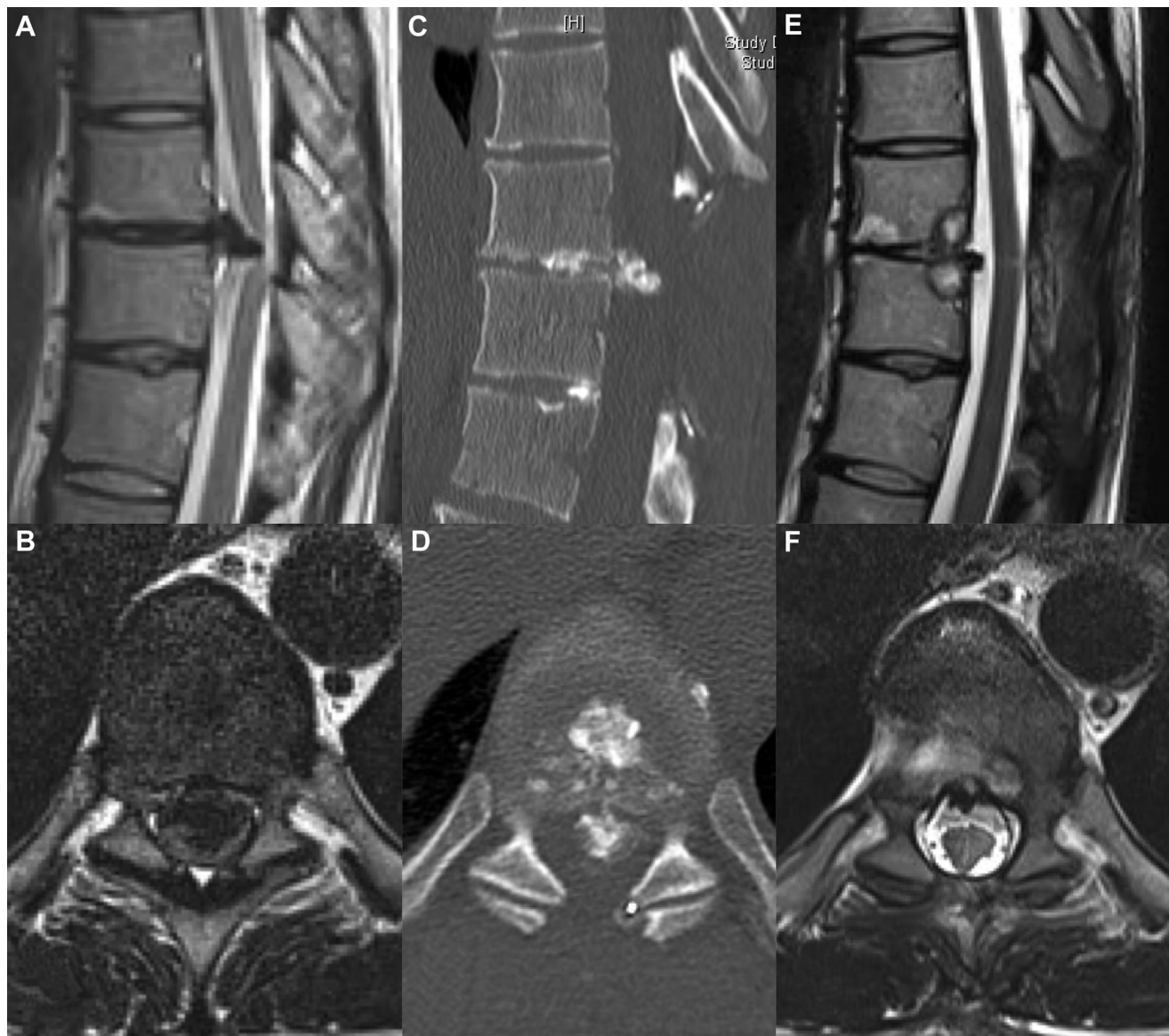
Figure 2. Case 2. Sagittal (A) and axial (B) T2-weighted magnetic resonance imaging (MRI) demonstrating a large, calcified left mediolateral thoracic disc herniation at T9–10, causing cord compression. Early postoperative sagittal (C) and axial (D) computed tomography scans demonstrating

posterior decompression. Sagittal (E) and axial (F) T2-weighted MRI. An anterior thoracoscopic approach allowed complete resection of the lesion and adequate decompression.