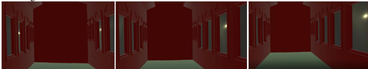
Figure 2. Three screenshots from the participants' point of view in the moving condition, with the lights moving from front to back

For 16 participants, the virtual environment was stationary, while for the remaining 16 participants, the train was moving, which was visually achieved by the moving of lights past the window (see Figure 2). In order to avoid any bias as a result of visual inspiration, no landscape was visible through the train's windows, as if the participants were in a tunnel. Thus, when the train was moving, the lights from inside the tunnel could be seen moving by. This train set was designed to represent a visual movement without movement of the user, while also avoiding motion sickness.