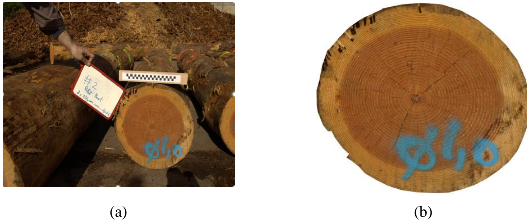
Fig. 1: Images of log #02: log end image taken on the log-yard ; the corresponding manually segmented log image.

(Swaroop and Sharma 2016). These methods are simple and intuitive, but tend to fail when images have large rotations, large illumination levels, large scale differences, etc. Conversely, the feature-based methods are generally invariant to scale, rotation, and illumination, etc. Among them, the scale invariant feature transform (SIFT) (Lowe 2003) method is most common. However, as with other feature-based algorithms, its matching performance depends strongly on the quality of feature extraction, which is sensible to noise.