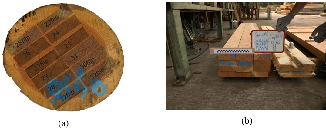
Fig. 2: (a) Manual positioning of the board end image for log #02 (flip means that the board end image had to be flipped to be in the right orientation); (b) A pile of boards from log #02.