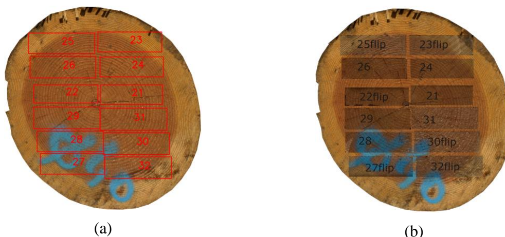
Fig. 5: (a) Final board recognition results on log #02; (b) Manual positioning of the board end image on the end image of log #02.