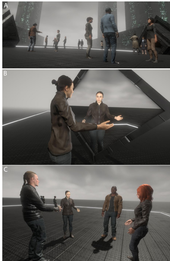
Figure 1. The scenario (A) The square between the tall buildings showing the groups. (B) A participant sees her body-double in front of the mirror during the embodiment phase before it goes out to the crowd. (C) The participant interacting with one of the groups.

After this they answered a questionnaire regarding presence in the virtual environment, body ownership and agency (Supplementary Table S2). High subjective levels of presence and body ownership and agency are necessary conditions for the experiment to make sense. Therefore, we do not make inferences with respect to these variables to a wider population, we are only interested in the results for this particular sample. The detailed results for these variables are shown in Supplementary Fig. S1. The levels of reported presence, body ownership and agency are high and not different between the Random and Targeted groups, and are similar to previous studies (e.g., Ref. 22 ).