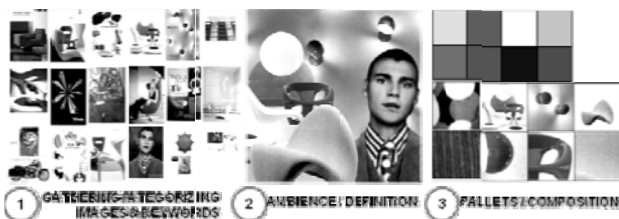
Figure 1: The Conjoint Trends Analysis (CTA) method

The information phase of the cognitive design activity was studied and formalised in order to define the Conjoint Trends Analysis (CTA) method [1]. As shown in Figure 1, the CTA method is composed of three steps: gathering/categorizing images and keywords; ambience definition; and pallets composition. The CTA method enables the identification of attributes linked to particular datasets (e.g., common properties of images in a database) so that they can be used to inspire designers in the early stages of design for new product.