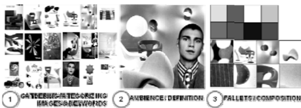
Figure 1: The Conjoint Trends Analysis (CTA) method

The information phase of the cognitive design activity was studied and formalised in order to define the Conjoint Trends Analysis (CTA) method [1]. As shown in Figure 1, the CTA method is composed of three steps: gathering/categorizing images and keywords; ambience definition; and pallets composition. The CTA method enables the identification of attributes linked to particular datasets (e.g., common properties of images in a database) so that they can be used to inspire designers in the early stages of design for new product.