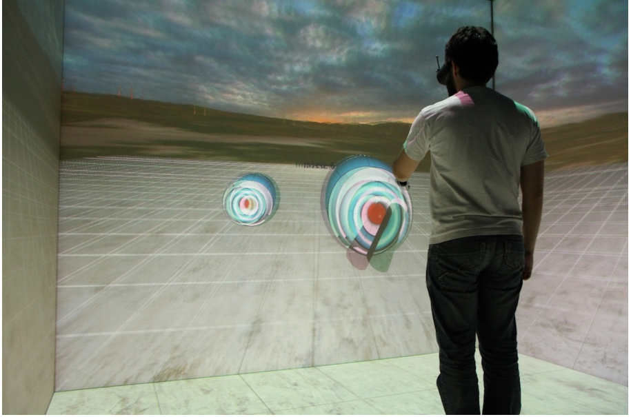
Fig. 1. Experimental setup with an array two spheres