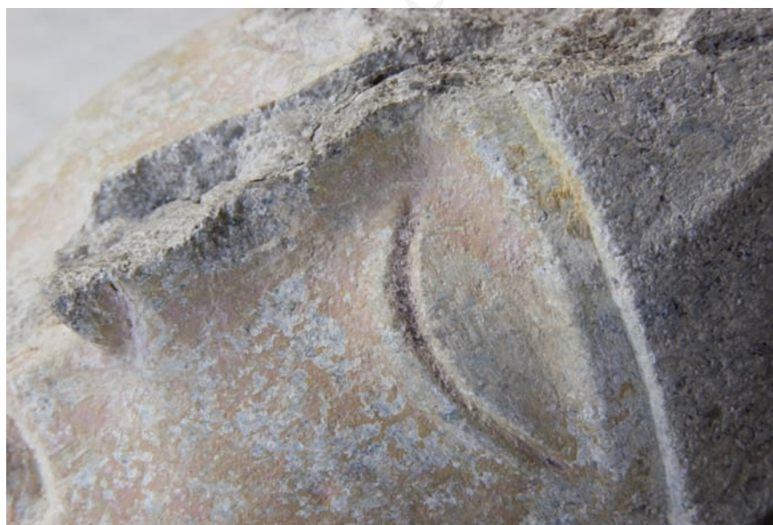
Figure 3. Head of the sleeping soldier (limestone, 16x9 cm) coming from the lintel. Reproduced with permission of S. Castandet.