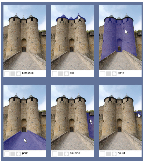
Fig. 4: interactive image displays different semantic of the object

The area of each element present in the image is calculated using the position of the polygon vertices. This information can be useful in further development. For example, we can use this percentage as criteria for image searching or use for sorting selected information.