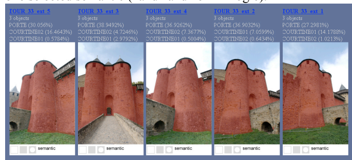
Fig. 5: result images using term "tower" and "Curtain wall" as criteria

For this function, the system automatically retrieves every available semantic in the database that corresponds to the selected project and creates a list for user to choose. One can also control the precision of image detection by giving the limit of the area representing the object in the image. Multiple selections can also be used, and the user can filter either including all the selected criteria or images that have at least one selected semantic ("and" and "or" in logic).