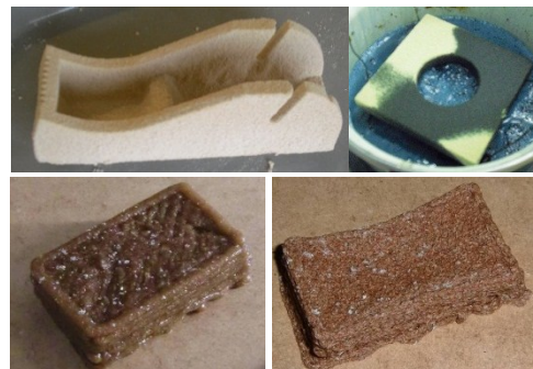
Fig 5. Review of models produced: wood powder and wood pulp.

After making several models, we observed some irregularities in their geometries. During the scan of pulp depositing, the changing of directions of tool generates protrusions mainly due to poor control of the run extrusion. Nevertheless, the shape of the model corresponds to the initial geometry and the manufacturing process has functioned according to the approach. Subsequently, internal tensions gradually deform the geometry during the drying.