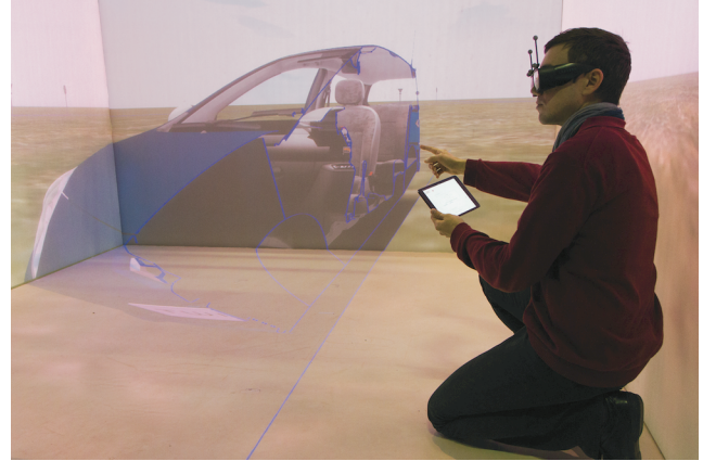
Figure 1: VARI 3 allows a user to explore and modify a single virtual vehicle model displayed simultaneously on both a CAVE and a tracked tablet.