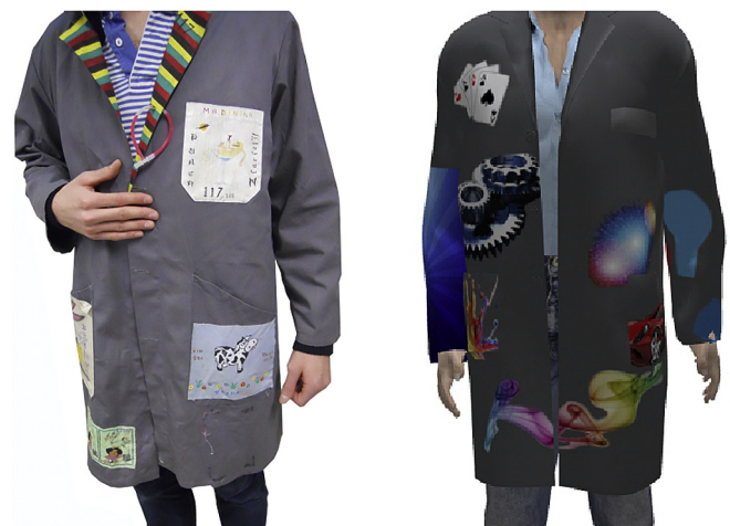
Fig. 1. Example of a real customized coat (left) and a virtual one for avatars (right).

All participants were students from ENSAM (École Nationale Supérieure d'Arts et Métiers), which is a French school of engineering known for the strong social identity of its students. This is a prestigious school, which has trained over 85,000 engineers since its foundation in 1780. Students and alumni of the school call themselves Gadzarts (in the remainder of the article, we use the term “ingroup” to refer to Gadzarts ), which means “ Gars des Arts ” (i.e., “Guys from the Arts”, “the Arts” being the school's short name). Gadzarts are organized in an association and perpetuate their own traditions and folklore, which comprise special clothing, language, songs, legends, related symbolism, and ceremonials. All these items reveal a strong and positive social identity. Traditional clothing includes a gray biaude (see Fig. 1, left), which is a sort of blouse that