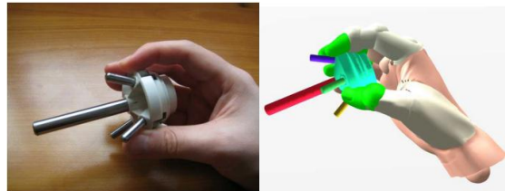
Figure 2. Configuration of a real/virtual hand for object grasping.