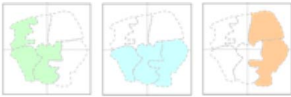
Figure 4: Final directions represented on the PCA diagram. From left to right: “Light and organic refinement”, “Simple and smooth aquatic life” and “Intelligent and surprising high-technology”

this area as well as more generally on the clusters “Unexpected” and “Innovative and high-tech”.