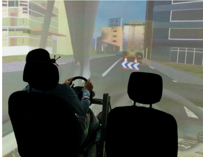
Figure 1: P2I CAVE Driving Simulator