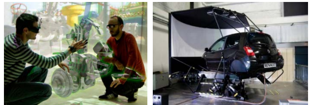
Figure 2: CAVE system (left) and dynamic driving simulator (right).