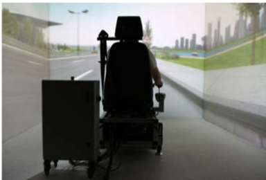
Figure 5: 3 DOF driving simulator during the experiments.

Motion sickness may appear when the field of view is recovered and the vestibular system is not excited. To study these effects during the driving in a CAVE, we conducted several experiments under 8 conditions for both static and dynamic situations at a same driving scenario (mono visual type, stereo visual type, 60 degrees of horizontal field of view in CAVE, full horizontal field of view in the CAVE).