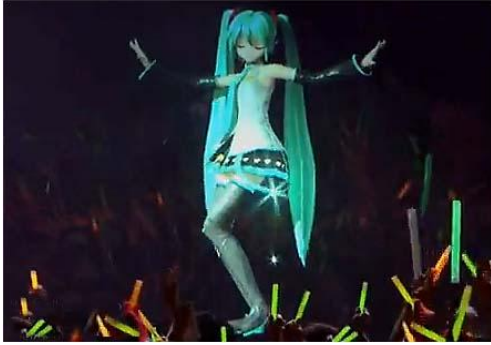
Figure 1: Miku the singing, digital avatar. [4].

Miku pranced around several stadium stages as part of a concert tour, where the capacity crowds waved their glow sticks and sang along 2009" [4].