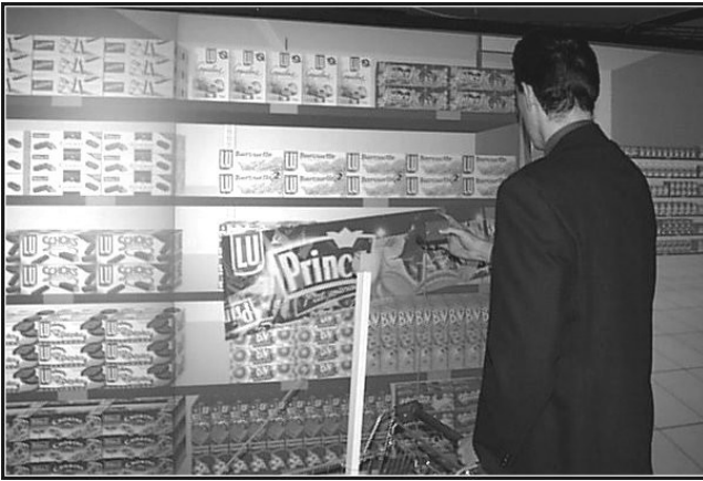
Figure 3. Virtual store for IN VIVO, designed and produced by the Ecole des Mines ParisTech and by the company Sim Team

The useful VBPs are determined on the basis of the I2f indicated in the FTR. For example, with regard to the virtual store for analyzing buying behavior [3], we determine 3 fundamental VBPs: the observation of the product / three dimensional handling and the spatial orientation of the product / observation of the products on the shelf. We therefore also define 2 secondary VBPs: the ease with which the customer moves and orients in the virtual store (VE) / the possibility of the customer picking up a product and then putting it back on the shelf or in the trolley.