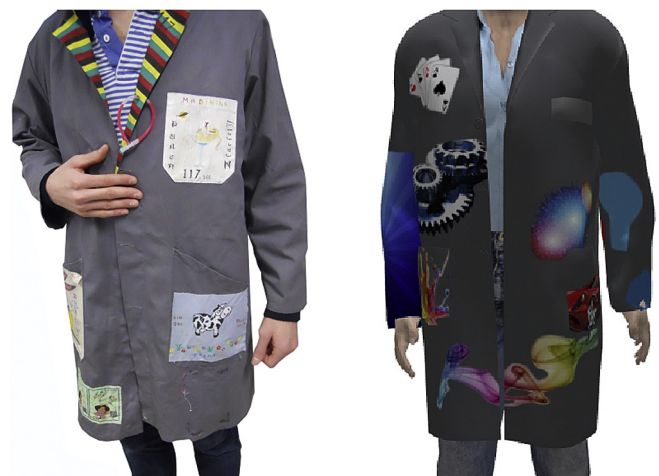
Fig. 1. Example of a real customized coat (left) and a virtual one for avatars (right).

All participants were students from ENSAM (École Nationale Supérieure d'Arts et Métiers), which is a French school of engineering known for the strong social identity of its students. This is a prestigious school, which has trained over 85,000 engineers since its foundation in 1780. Students and alumni of the school call themselves Gadzarts (in the remainder of the article, we use the term “ingroup” to refer to Gadzarts ), which means “ Gars des Arts ” (i.e., “Guys from the Arts”, “the Arts” being the school’s short name). Gadzarts are organized in an association and perpetuate their own traditions and folklore, which comprise special clothing, language, songs, legends, related symbolism, and ceremonials. All these items reveal a strong and positive social identity. Traditional clothing includes a gray biaude (see Fig. 1, left), which is a sort of blouse that