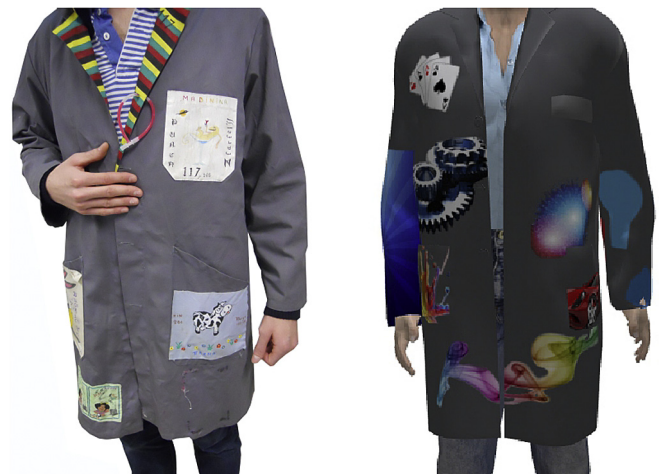
Fig. 1. Example of a real customized coat (left) and a virtual one for avatars (right).

All participants were students from ENSAM (École Nationale Supérieure d'Arts et Métiers), which is a French school of engineering known for the strong social identity of its students. This is a prestigious school, which has trained over 85,000 engineers since its foundation in 1780. Students and alumni of the school call themselves Gadzarts (in the remainder of the article, we use the term “ingroup” to refer to Gadzarts ), which means “ Gars des Arts ” (i.e., “Guys from the Arts”, “the Arts” being the school’s short name). Gadzarts are organized in an association and perpetuate their own traditions and folklore, which comprise special clothing, language, songs, legends, related symbolism, and ceremonials. All these items reveal a strong and positive social identity. Traditional clothing includes a gray biaude (see Fig. 1, left), which is a sort of blouse that