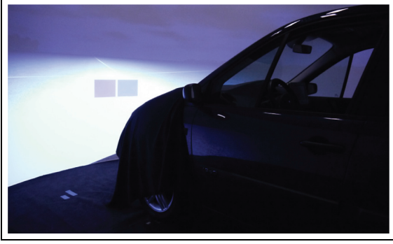
Figure 2. Experimental conditions for the second experiment.

In this experiment, the population was composed of three color experts from Renault (design department). Two persons worked on industrial quality validation and the other person worked on color and material assessment. Because of the expert nature of this population, we considered, as a predicate of this experiment, that their results should be highly close among themselves and that the result would not depend on the number of participants.