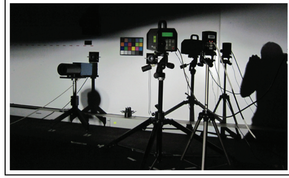
Figure 3. Real measurement conditions for the Macbeth ColorChecker chart white patch.

To avoid color modification of the entire scene, we applied a fragment shader only to the three-dimensional headlight projection. This fragment shader modifies the color using the von Kries chromatic adaptation model (see Equation (3)), where full adaptation by the observer is assumed. The CAT matrices used in this work are listed in Table 1.