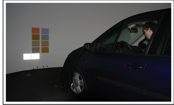
Figure 1. Experimental conditions for the first experiment. The projector illuminates an NCS patch and displays a virtual patch next to it.

To obtain psychophysical functions, the constant-stimuli method was used, with the two-alternative forced choice (2AFC) procedure. 20 During the test, a computer program randomly illuminates, using a calibrated Barco Galaxy NW-12 sRGB projector with \gamma = 2.2 and a D65 white point, one of the NCS patches and, simultaneously, a virtual color next to it (see Figure 1, which shows the white patch). Usually, a gray background is used to compare two colors. 21 For our application, we used the mean