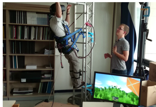
Figure 2: The work-at-height simulator in operation.

We expect our simulator to be deployed in companies dealing with work at height as an additional tool to detect acrophobic persons and thus hire only non-acrophobic workers. Though our simulator meets the first industrial requirements, it is still in development and further functionalities need to be added. Especially we could integrate other sensory cues such as air motion to simulate gusts of wind while at height. As the tasks addressed here are usually performed with live power lines, we could add a haptic feedback when a user touches a virtual power line.