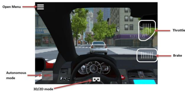
Figure 4 - Driver's view and UI

Moreover, a second version was developed, adding more interactions as well as networking functionalities. The users drive a car in an American city using a mobile device. The car's steering wheel is controlled by the device's tilt while two touch-controlled buttons serves as the brake and throttle (Figure 4).