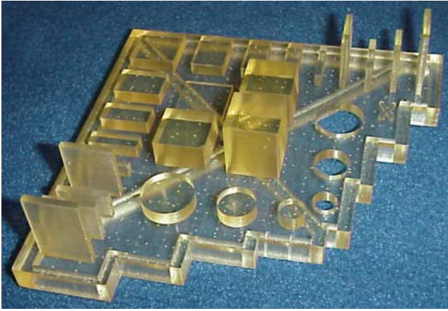
Fig. 4 Resin test part realized by laser stereolithography

Along the X axis of the completed part, we note that the deviation between the theoretical and measured value is significant (0.33 mm on average). The deviation is a little more significant along the Y axis (0.39 mm on average). These deviations vary little relating to the thickness of the forms and are positive (the obtained dimensions are higher than the theoretical ones).