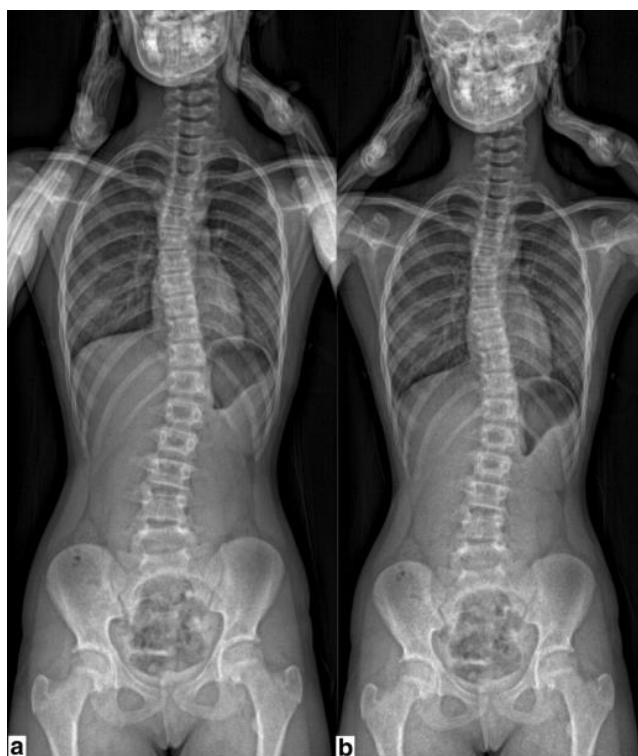
Fig. 3 a Coronal full-spine image in EOS scanner using micro-dose protocol. b Coronal full-spine image in EOS scanner using reduced micro-dose protocol

A group of 18 consecutive children going for routine clinical investigation for scoliosis were then assessed with both micro-dose and reduced micro-dose imaging. Three children were excluded; two were carrying braces during imaging, one had an abnormal number of vertebrae (14 thoracic vertebrae). The remaining 15 children were included in the study. The Mean age was 10.7 years (range 4-12), Gender distribution amongst the included patients: four males and 11 females. Mean reconstruction time was 10 minutes (range 6-21 minutes) for the micro-dose and 9 minutes (range 5-16 minutes) for the reduced micro-dose. Reconstruction time was not correlated with Cobb angle (i.e., with scoliosis severity, p > 0.05 ).