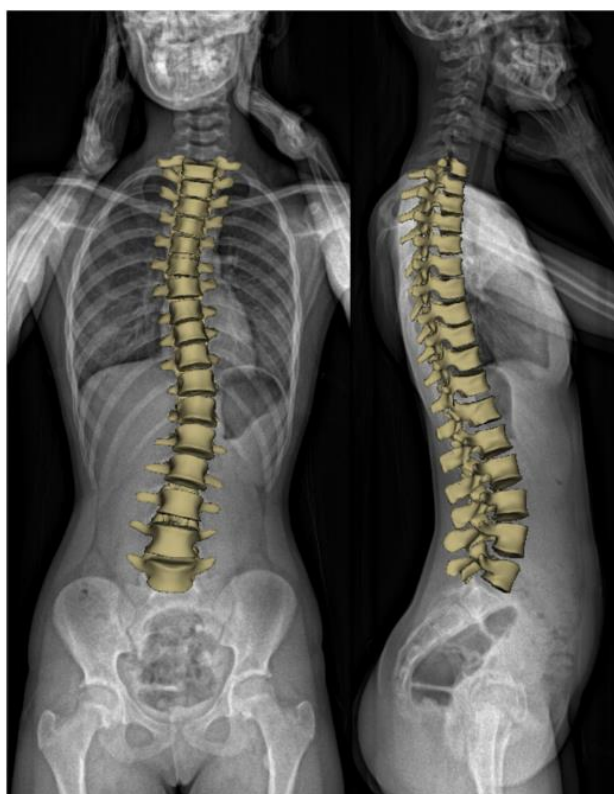
Fig. 2 Examples of 3D reconstruction from reduced micro-dose protocol, coronal and lateral views

A validated method of 3D reconstruction of the spine from EOS 2D biplane images was used [15]. Patient data and acquisition settings were blinded and reconstructions took place in random order. Three operators, all trained within 3D reconstructions, did two reconstructions for each obtained image. One operator determined, for each patient, the levels of junctional and apical vertebrae for each scoliotic curve. Table 2 lists the 3D parameters investigated. Figure 3 illustrates 3D reconstruction images using the reduced micro-dose protocol.