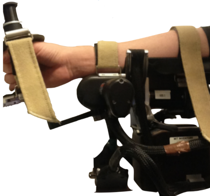
Figure 1. Massachusetts Institute of Technology Wrist-Robot and experimental forearm, wrist, and hand position (excluding finger strap).

Wrist quasi-stiffness was evaluated using a 3 degree of freedom Wrist Robot (Figure 1, InMotion 3.0, Interactive Motion Technologies, Watertown, MA, USA), described elsewhere [25]. The robot forearm support positions the wrist joint so it aligns with the rotation axes of the robot. The Wrist Robot generates torques and simultaneously records the angular displacement produced into wrist flexion-extension (FE) and radial-ulnar deviation (RUD) [25]. A strap was used to lock forearm pronation-supination of the robot to eliminate confounding forearm movements during the trial. A gravity compensator was included in the robotic set-up to reduce the influence of gravity on the data collected. The gravity compensator was constant for each direction and equivalent to the sum of an average hand mass and the robot handle mass.