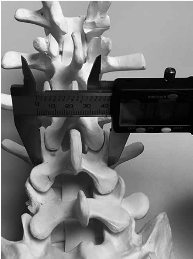
Figure 1 Caliper measurement of interspars distance. Demonstration of caliper measurement of the interspars difference of a lumbar vertebrae. We have defined the interspars distance as narrowest distance between lateral edges of the posterior elements.

total vertebrae) by the American Museum of Natural History (New York, NY). These were mature specimens without degeneration or malformation. Of the 53 specimens measured, 33 were male, 13 were female, and 7 were of unknown gender. Age, height, weight and preparation data were unavailable. The interspars distance was measured using a Tresna® digital caliper accurate to 0.01 mm according to its ISO9001:2000 technical specifications. A single operator performed each interspars measurement three times at each lumbar level for each specimen.