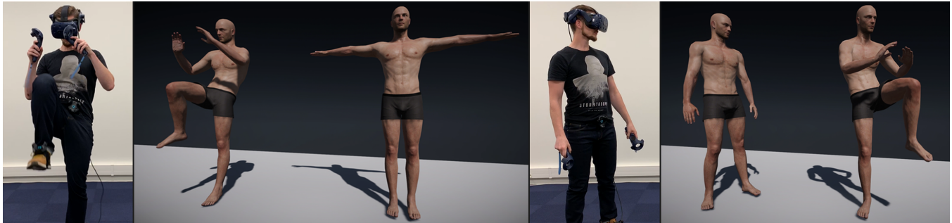
Figure 1: Tracked movements being recorded and replayed on a second virtual character.

charlotte.dubosc@ensam.eu LAMPA, Arts et Métiers Institute of Technology Changé, France