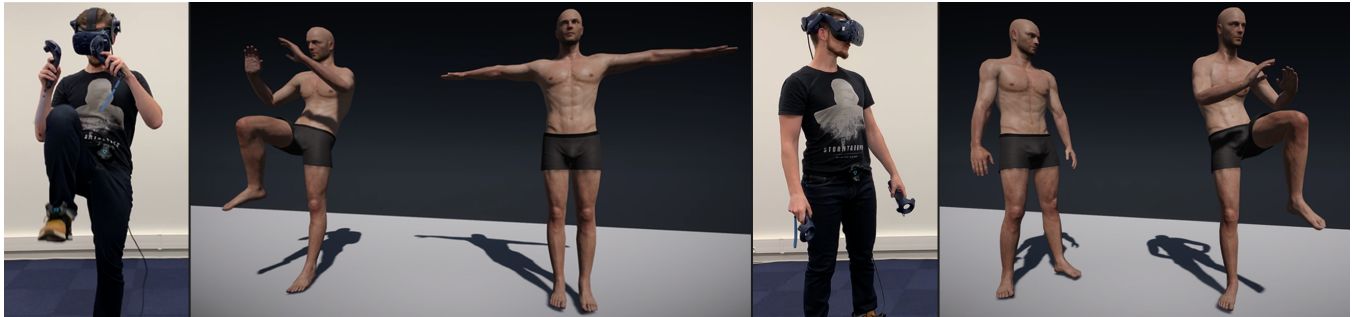
Figure 1: Tracked movements being recorded and replayed on a second virtual character.