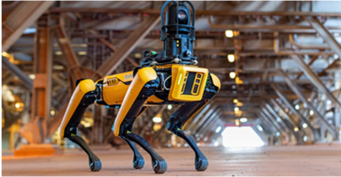
Figure 14.3. Spot®, Bostondynamic's robot dog

acquisition, many solutions have been developed over several years, allowing for object recognition and automatic insertion/prediction of invisible objects (Tang et al. 2010). With the help of 4.0 technologies, professionals are also proposing increasingly innovative means of surveying, which they praise for their performance, ergonomics and accuracy. In addition to digitalizing buildings using drones, Geoslam is now offering the original Zeb Go 16 acquisition process, which can obtain 43,200 points per second. The announced accuracy is +/- 0.1% or 1 cm, and this product only requires a simple movement, camera in hand, inside the building to transcribe the existing into a point cloud. The growing use of tablets is pushing developers to innovate and solutions such as ARtoBuild 17 can now generate 2D plans in PDF format and 3D plans in IFC format from tablets of 10 inches or more.