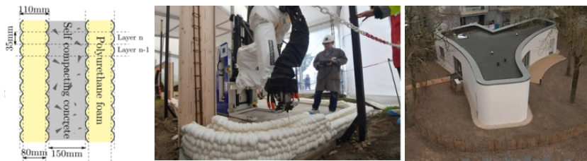
Figure 14.4. Implementation of the Yhnova project

Once again, it is necessary to distinguish between the construction phase and the building operation phase. Future constructions and the emergence of smart cities suggest “over” exploitation of 4.0 technology to make buildings more intelligent, comfortable, economical and secure (Beddiar et al. 2019). It is, however, still rare to combine all or part of the digital developments presented in this chapter for construction purposes to thus develop and exploit an ICPS in construction. Some experiments are, however, undertaken in this direction and are the subject of publications or POCs (Furet et al. 2019; You and Feng 2020). The solutions implemented in this last publication to “ print ” a 95 m 2 social housing and named Yhnova are, for example, based on a technology named Batiprint3D 19 and developed by teams from the University of Nantes (LS2N, GeM). This work, which was launched in 2017, required the development of a set of processes centered around a specific “autonomous” robotic machine rolling directly on a concrete slab, the base of the future building. This ICPS consisted of a poly-articulated arm (PAA) to print the walls (“standard” robot, branded Staübli 20 ) and the automatic guided vehicle (AGV) came from the company BA Systèmes 21 .