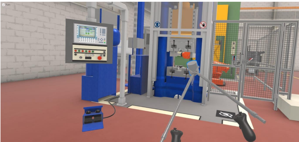
Figure 3. The learner manipulates a billet using a wrench

With the help of an interactive digital twin of the forge, learners have the opportunity to redo practical exercises from home or on campus whenever they wish for revision. This tool goes beyond a simple video presentation of the content because students can actively replicate the actions, such as handling metal pieces, themselves (see Figure 3).