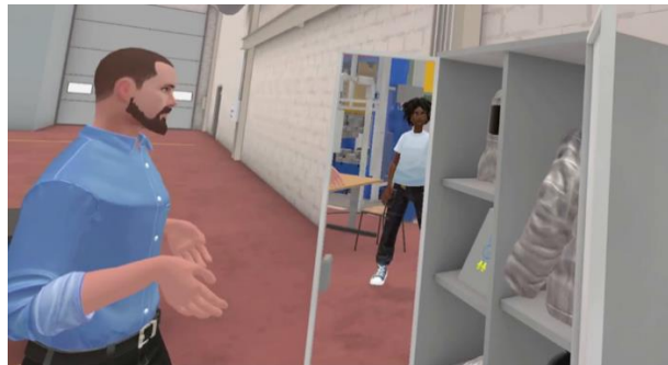
Figure 4. Virtual embodiment of the instructor

In the digital twin scenario of the forge, the PA is envisioned as an interactive virtual embodiment of the instructor, enabling real-time, dynamic interactions with learners in the virtual environment (Figure 4). Moreover, when powered by generative AI, the PA can be transformed into an ideal professional role model, offering students a multifaceted learning experience.