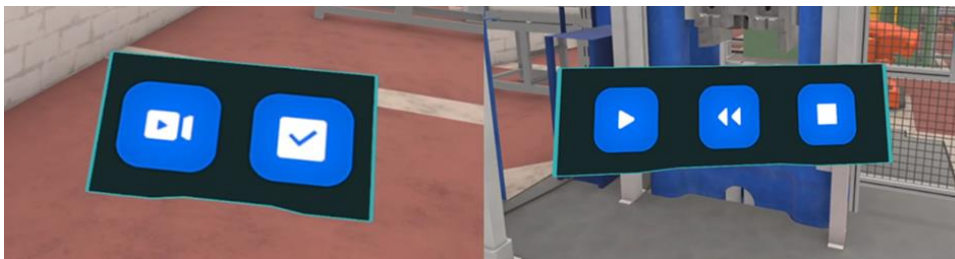
Figure 6. User interfaces included in VR app for recording and visualization functionalities

Engaging in behaviorally active learning situations does not automatically ensure cognitive engagement for learners. One effective method to address this is the application of generative learning strategies , which facilitate the reorganization and assimilation of new knowledge (Fiorella & Mayer, 2016). Such strategies typically involve synthesizing knowledge through written summaries, a process that helps structure and solidify the learning. However, immersive virtual environments often do not support traditional notetaking, leading learners to remove their VR headsets for writing activities in the physical realm (Klingenberg et al., 2023; Parong & Mayer, 2018). This shift creates a disconnection between the practice environment and the space where the reflection occurs. To bridge this gap in our digital twins, we have developed a feature that enables learners to record their voice and interactions with the environment using their avatar's embodiment. This user-friendly feature includes interfaces for starting and stopping recordings (Figure 6). The generative nature of this activity presents two critical advantages over standard notetaking. First, it stimulates two learning modalities to build a robust mental representation: verbalization through self-explanation and physical enactment. Second, the activity occurs within the learning environment, integrating the knowledge in a realistic setting.