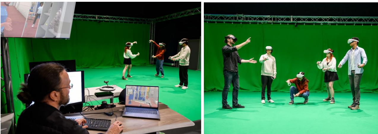
Figure 2. Illustrations of possible classroom situations with an immersive digital twin and a group of student supervised by a teacher.

This lack of democratization is also evident at the level of educational institutions. Higher education establishments today have "computer rooms" equipped with computers, but not all of them are equipped with "virtual reality rooms." However, providing such equipment is necessary as not all students have access to it. Additionally, this type of equipment imposes significant space constraints, with manufacturers often recommending around 9 square meters for a user to move and perform movements without space-related difficulties. In these conditions, it is challenging to envision having spaces large enough to accommodate virtual reality headsets for as many students as typically found in a practical session group (often one dozen students). In practice, the most likely scenario involves compromises in terms of space and the quantity of available equipment. For this reason, having an alternative version of the digital twin accessible on a computer, can be operated with a keyboard and a mouse, offers more possibilities for teachers because it is easier to allocate one computer per student. However, if ideal hardware conditions are met (small groups with an adequate number of headsets and ample space), the pedagogical potential is significant. Collaborative immersive practical work with monitoring by the instructor on a computer or even guidance by the instructor in virtual reality, for example (see Figure 2), becomes possible.