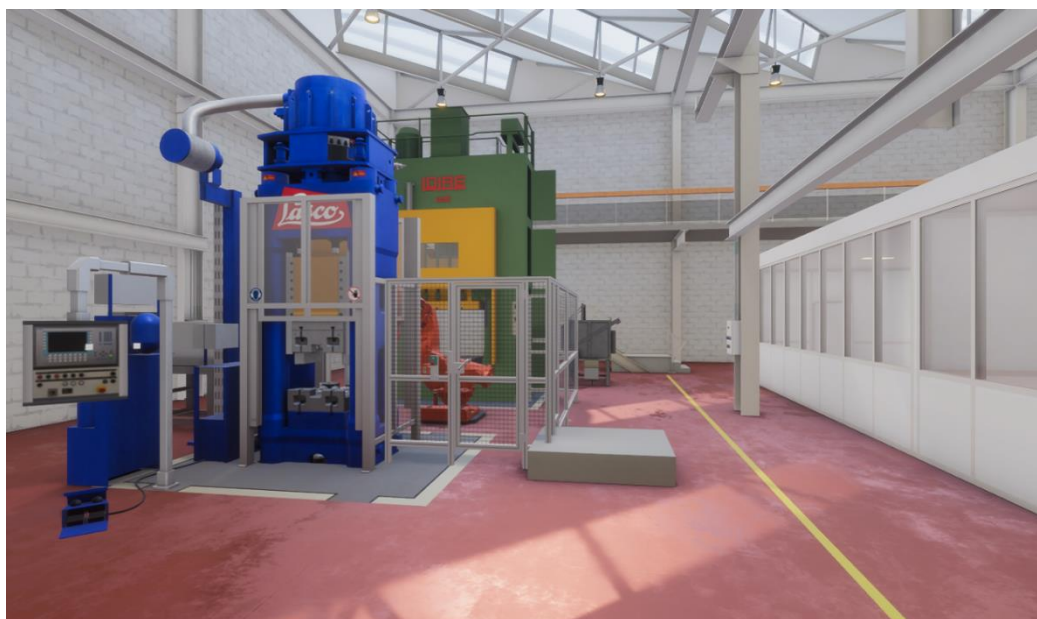
Figure 1. Screenshot of the Industrial Forge Digital Twin

In the following sections of this article, we outline the benefits and limits of immersive and interactive digital twins, as well as their implications for individual study and their potential in terms of additional pedagogical features. To illustrate each of these points, we will provide examples based on an existing digital twin that we are developing, simulating an industrial forge (see Figure 1).