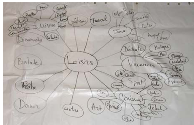
Fig. 2. Example mind-map.

In general, creativity methodological framework [7] support a two-step process: first, diverging by producing a vast number of ideas, then converging by selecting a few of them to be further developed. Mind-maps [2] are used in the diverging step. The mind-map principle is based on associative logics and is used for defining the problem to address. The field to explore is written in a central box and the participants express their free associations to this concept. Those ideas are written in new boxes placed as a crown around the central concept (see Fig. 2). A second association level is then built from the primary ideas, etc. Because the second level of association is not directly related to the initial problem, new-original research directions can appear and the realms of possibility grow. Mind-mapping can be performed individually or in a group session. In the latter case, the session has to be managed by an animator whose