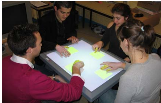
Fig. 1. Example of a tabletop system using MERL DiamondTouch device [5].

Tabletop systems (see Fig. 1) are multi-user horizontal interfaces for interactive shared displays. They implement around-the-table interaction metaphors allowing co-located collaboration and face-to-face conversation in a social setting [12, 13].