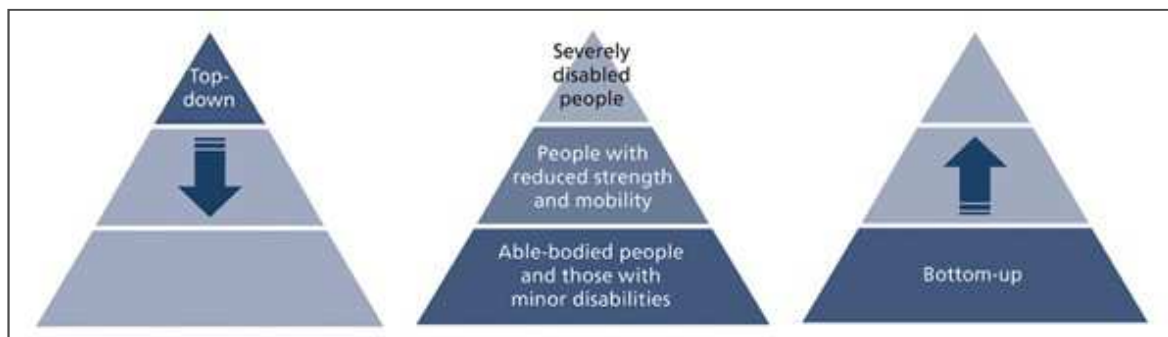
Fig. 2. Top-down and bottom-up approaches in Universal design.

The state of the art of Universalist movements shows that there are two main approaches to design products adapted to everyone (Fig. 2): An adaptive or top-down approach which consists in designing specialized products and extending them afterwards to other kinds of users; and a proactive or bottom-up approach to design products intended for the maximum of users (like Inclusive design). Note that top-down or adaptive Universalist approach corresponds to the bottom-up approach in niche marketing: it consists in designing specific products that can be extended to a broader population (i.e. market extension in niche marketing). To achieve a successful niche strategy, the Universalist adaptive design process should therefore address the special needs of a given segment of disabled people with a differentiation plan for subsequent market extension.