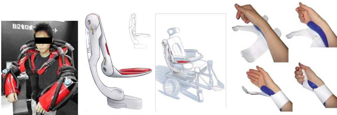
Fig. 4. An existing powered orthose (left), our design (center, here mounted on a wheelchair) and the “glove” control interface (right).

Social Integration: Needs analysis from disabled people emphasized the noise and the look of existing products as major rejection criteria, before the weight, reliability problems or efficiency problems. Social acceptability therefore became a major design challenge for our project. To find relevant solutions we conducted a creativity session with disabled people, an occupational therapist, 2 technicians, an electronics engineer, a roboticist and an industrial designer. This session resulted in the selection of a design and a concept of seamless interface adjusting to user's arm like a glove (see Fig. 4) and using residual hand capacities to control the orthose. In the near future the TEASE project will end up with final evaluation and product certification.