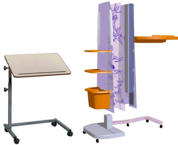
Fig. 3. An existing overbed table (left) and our design (right, exploded view).