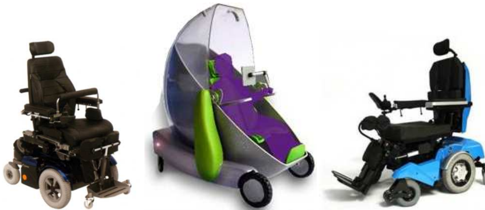
Fig. 5. An existing electrical wheelchair (left), one of our concepts (center) and the final WHING (right, here a blue model).

Social Integration: The first step of social integration was addressed by collecting sources of inspiration from the general category of small vehicles (small cars, scooter, baby strollers, segways, bikes...). We subsequently generated avant-gardist designs in order to mark a break with regard to existing wheelchairs (see Fig. 5). The attractiveness of our concepts for the mass market were validated through a semantic and emotional analysis with 15 disabled and 15 able-bodied subjects, aged 20 to 61 years. However, as previously mentioned, the WHING project later focused primarily on disabled people and adopted a less challenging design. A minimal customization of the wheelchair was preserved (choice of colors, see Fig. 5, right), which is still better than existing products that are not customizable at all.