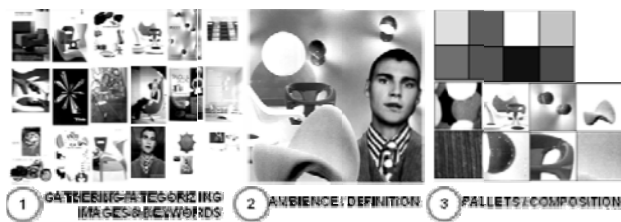
Figure 1: The Conjoint Trends Analysis (CTA) method

The information phase of the cognitive design activity was studied and formalised in order to define the Conjoint Trends Analysis (CTA) method [1]. As shown in Figure 1, the CTA method is composed of three steps: gathering/categorizing images and keywords; ambience definition; and pallets composition. The CTA method enables the identification of attributes linked to particular datasets (e.g., common properties of images in a database) so that they can be used to inspire designers in the early stages of design for new product.