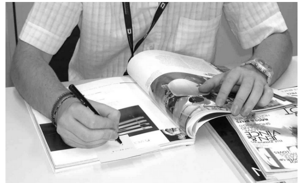
Figure 2: Design knowledge extraction by manual annotation [19]

In the TRENDS project, the data collection was carried out on the basis of fictional scenarios and extraction of design information from previous projects which have used the CTA method.