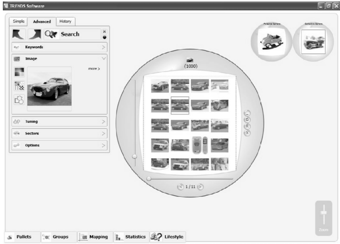
Figure 4: A global interface of the TRENDS system

- life style : a bookmark oriented towards specific websites which propose information about sociological changes, values and lifestyles evolutions. This function was a request of the designers themselves.