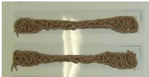
Figure 2: samples geometry

Test pieces are samples with non-constant geometry (Figure 2). The geometry of this is presented in picture 3 (Depending on the composition of the pulp, pieces do not look the same). The structure can vary from one specimen to another. We realize 3 samples per dough type and we will average the set of results (to avoid the spread).