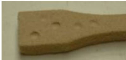
Figure 1: Several prints test.

This result is achieved through the average of the measures of several prints on a specimen (Figure 1) placed horizontally on an undeformable support (marble of a coordinate measuring machine). The structure and brittleness give varying impressions, which bring into question the reliability of the results but allows us to devalue the fragility of the object in printer output.