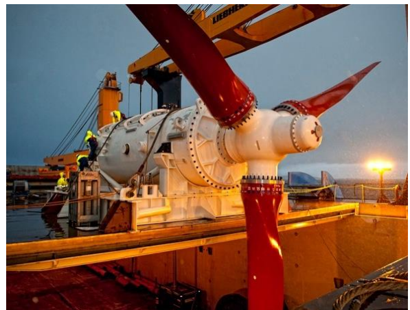
Fig. 2. Andritz Hydro Hammerfest HS1000 turbine © [12].