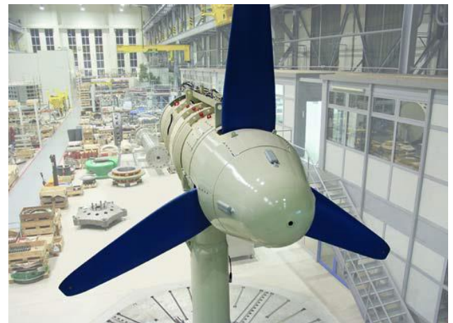
Fig. 5. Voith Hydro turbine © [18].