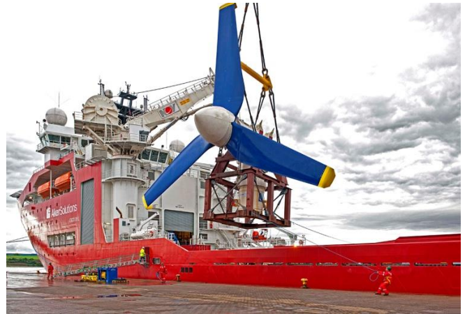
Fig. 3. Atlantis AR1000 turbine.

rotor diameter) which was tested at Bénodet estuary near Brest in 2008. The prototype D10 turbine is now completing the construction and is scheduled to be installed in the Fromveur passage at the end of 2014. Larger turbines D12 and D15 with power capacities of 1~2 MW are under design for future turbine farm applications [19-20].