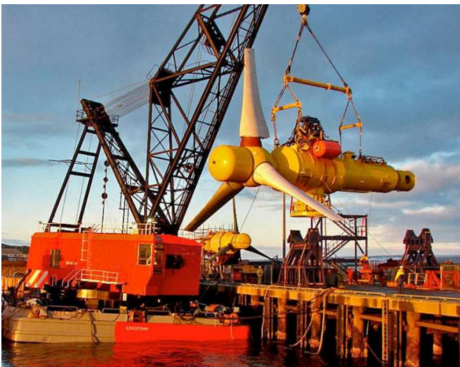
Fig. 7. Alstom tidal turbine.

In 2013, Alstom successfully installed a 1 MW tidal current turbine at EMEC tidal test site after the acquisition of Tidal Generation Limited (TGL) [23-24]. Figure 7 shows the Alstom's 1 MW tidal turbine system. This tidal turbine weighs 150 tonnes and has three pitchable blades, a rotor diameter of 18 m and a nacelle length of 22 m. A standard drive train and power electronics device is inside the nacelle. This turbine system can be installed in a water depth between 35 and 80 meters. It can generate electricity with a tidal current between 1 m/s and 3.4 m/s, and reaches the rated power for a tidal current speed of 2.7 m/s. This 1 MW Alstom tidal turbine is under extensive testing and analysis in different operational conditions off Orkney islands throughout 2013 over an 18 month period.