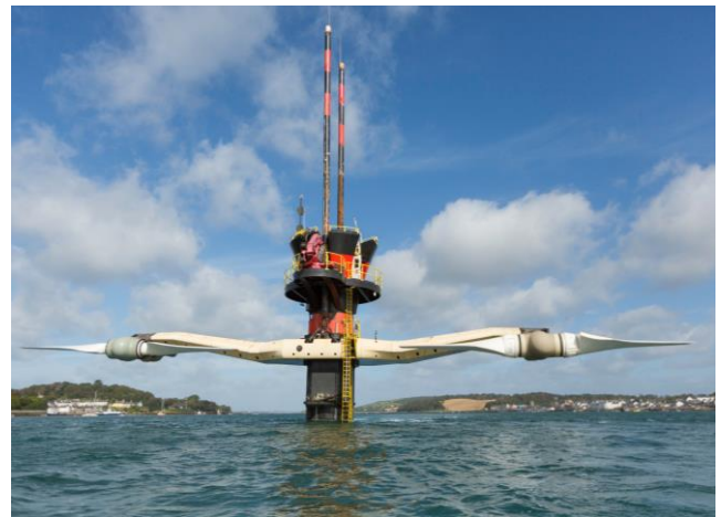
Fig. 4. SeaGen S turbine © [15].