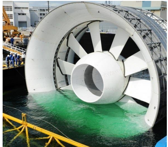
Fig. 1. DCNS-OpenHydro turbine © [11].

Another candidate for the MeyGen project is the AR1000 turbine (Fig. 3) technology developed by Atlantis Resources Corporation [14]. The Atlantis AR1000 turbine features fixed pitch configuration and is rated at 1 MW at 2.65 m/s current velocity. The AR1000 can be rotated in the slack period between tides using a yaw drive for optimally facing the tides. The first AR1000 was successfully deployed and tested at the EMEC facility during the summer of 2011. The AR1000 system is also scheduled to be installed on Daishan demonstration site in China during 2014. A larger turbine called AR1500 (1.5 MW at 3.0 m/s) is under development for