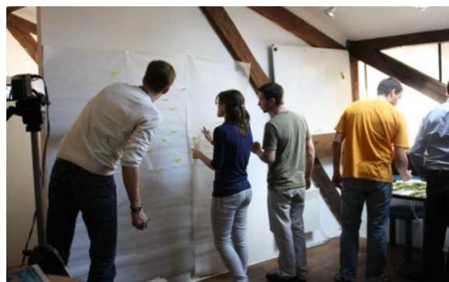
Figure 3. Collective mind mapping, phase 2.

Following the individual conception, all participants (per company) post-its were united in a word pool and sorted by three researchers together into the dimensions of phase one. To sort ambiguous words (e.g. orange – as a colour or an analogy), the context from the simultaneous verbalizations was taken into account. The participants gathered and each was given a marker of a different colour. They had 45 minutes to pick words from the pool, position them on a wall surface, and mark relations of the newly placed words with already