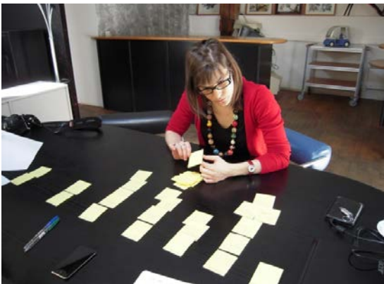
Figure 2. Sorting of concept words, phase 1.

The experimentation was audio-recorded. The post-it sortings were photographed and reprocessed into Excel sheets. Based on the initial groups sorted by the participants, the two interviewing researchers and a third colleague unified the sortings into 18 categories. Each researcher would make a proposal for the categorization and for those with diverging opinions the decision was taken in group agreement and with consideration of the participant's discourse. Once all the words had been assigned to a dimension, statistical data on the word occurrence per dimension and per profession was available.