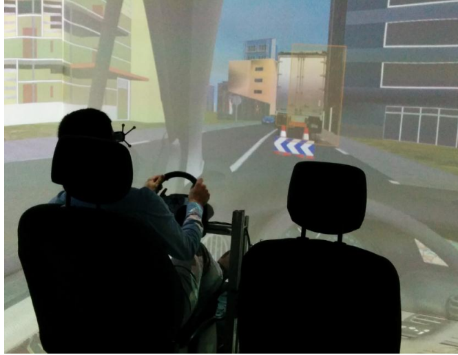
Figure 1: P2I CAVE Driving Simulator