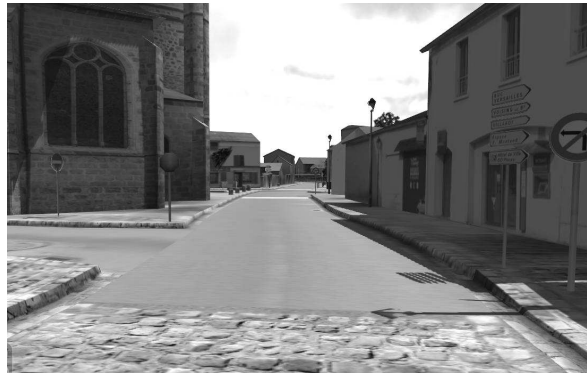
Figure 2. Virtual view of Guyancourt rendered with our open source simulation software

The visual scene is rendered using OGRE [1], an object-oriented open-source 3D render engine written in C++, customizable and extensible through the freely available plugins, enabling for instance OpenGL and DirectX support or bindings to multiple physics engines. Moreover, OGRE benefits from an active community. As currently configured, our visual module supports vertex lighting used to render for instance static ambient occlusion. Advanced projected shadows were also implemented using Parallel Split Shadow Mapping method (PSSM) and rendered using Variance Shadow Mapping technique (VSM) implemented in a pixel shader written in HLSL language (Figure 2). More generally, other visual effects can be implemented depending on the application, the performance of the computers and the features provided by the render engine.