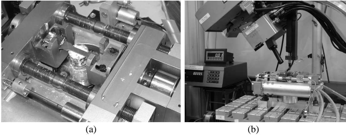
Fig1. In-situ tensile test device. (a) Micro tensile machine and cooler device. (b) X-Ray diffractometer.

A two-scale homogenization method is proposed to take into account the carbides distribution in a metallic polycrystalline medium (Pesci et al. [2003]). The elasto-plastic behavior of each single crystal of the ferritic phase is described in the frame of small strain and the activated slip systems are determined according to the Franciosi-Zaoui energetic criterion (Franciosi, Zaoui [1991]). A Mori-Tanaka model is used to compute the effective tangent modulus of a single crystal including carbides. A classical self-consistent method is then applied to the tangent moduli to determine step by step the effective behavior of the bainitic aggregate.